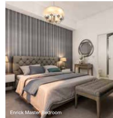
Enrick Master Bedroom